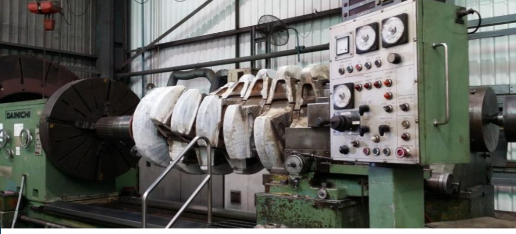
1300 Sizer Shaft on Hofmann Engineering's 10m Lathe for refurbishment

Hofmann Engineering offers complete mineral sizer solutions including new fabrication and overhaul of sizer shafts, teeth, spacers & caps, gearboxes and onsite service support.